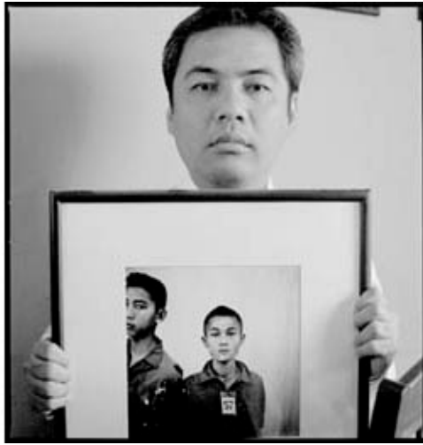
Out of the Poison Tree