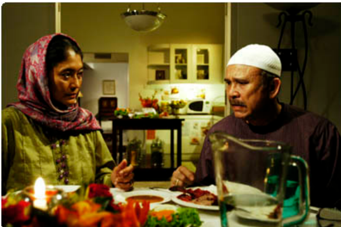
Love for Share